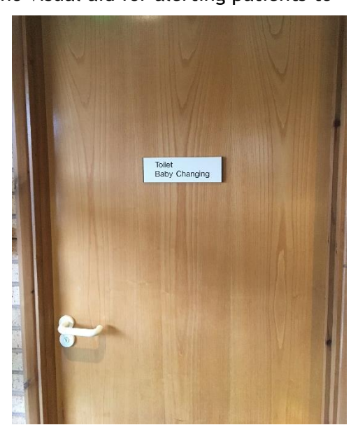
Large disabled toilet with baby changing

Fire exits were clearly labelled but the assembly point was not indicated. Two toilets were available: one large disabled toilet with a baby change area and a second toilet next to clinicians' rooms. Both toilets were spotlessly clean. The disabled toilet did not have a wheelchair sign on the door, and it is recommended one is put in place. No sign was observed to the toilet located next to the clinicians' rooms and would be beneficial. This point will be returned to in the recommendations.