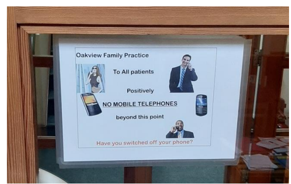
A sign using easy-read formatting

No photos of staff were observed. On the practice's website, there is a very useful section of staff including their photos, that may be replicated within the practice. This point will be returned to in the recommendations.